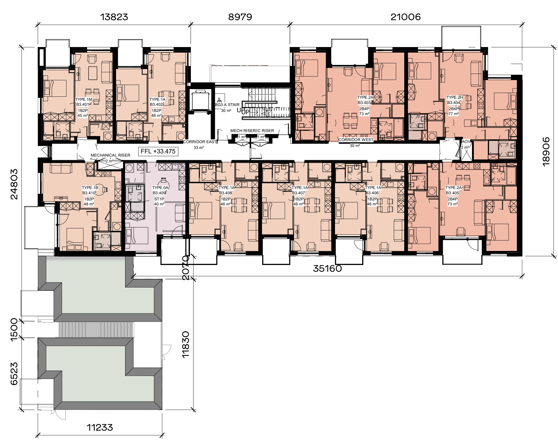
1 1200 BG3 BLOCKPLAN_L04_FFL 1 : 200